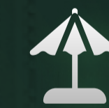
LA MER BEACH