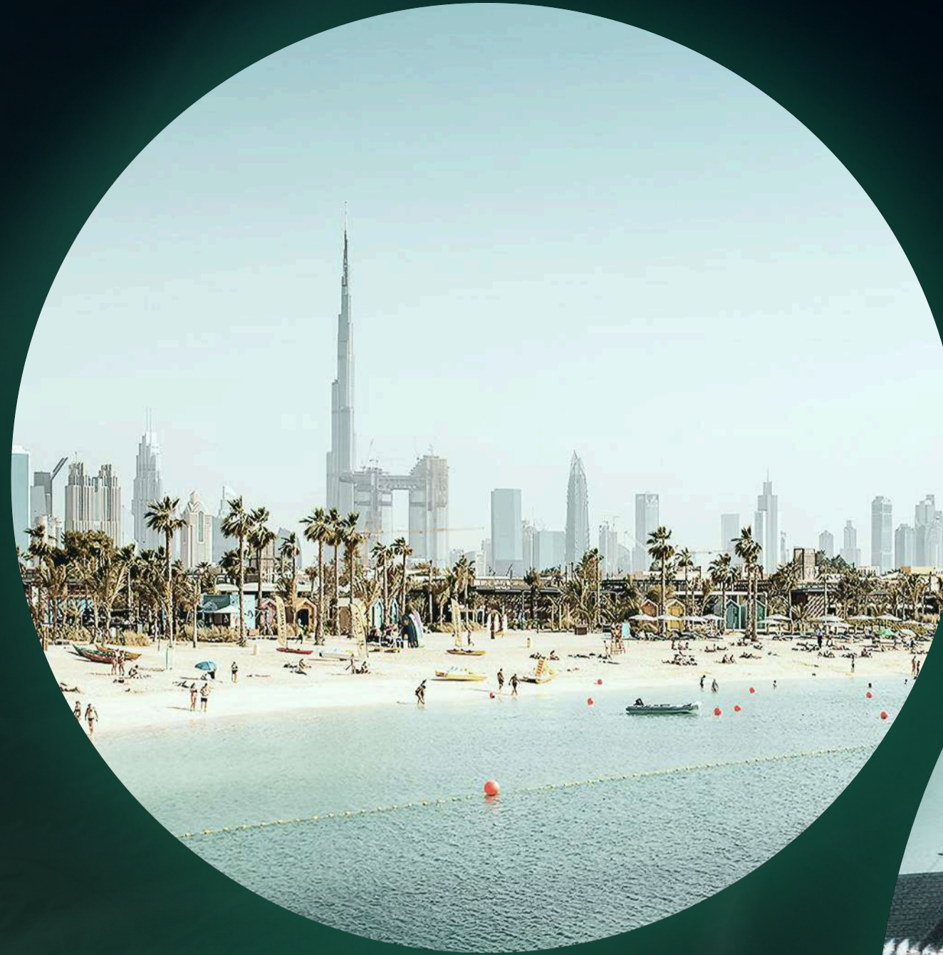
LA MER BEACH