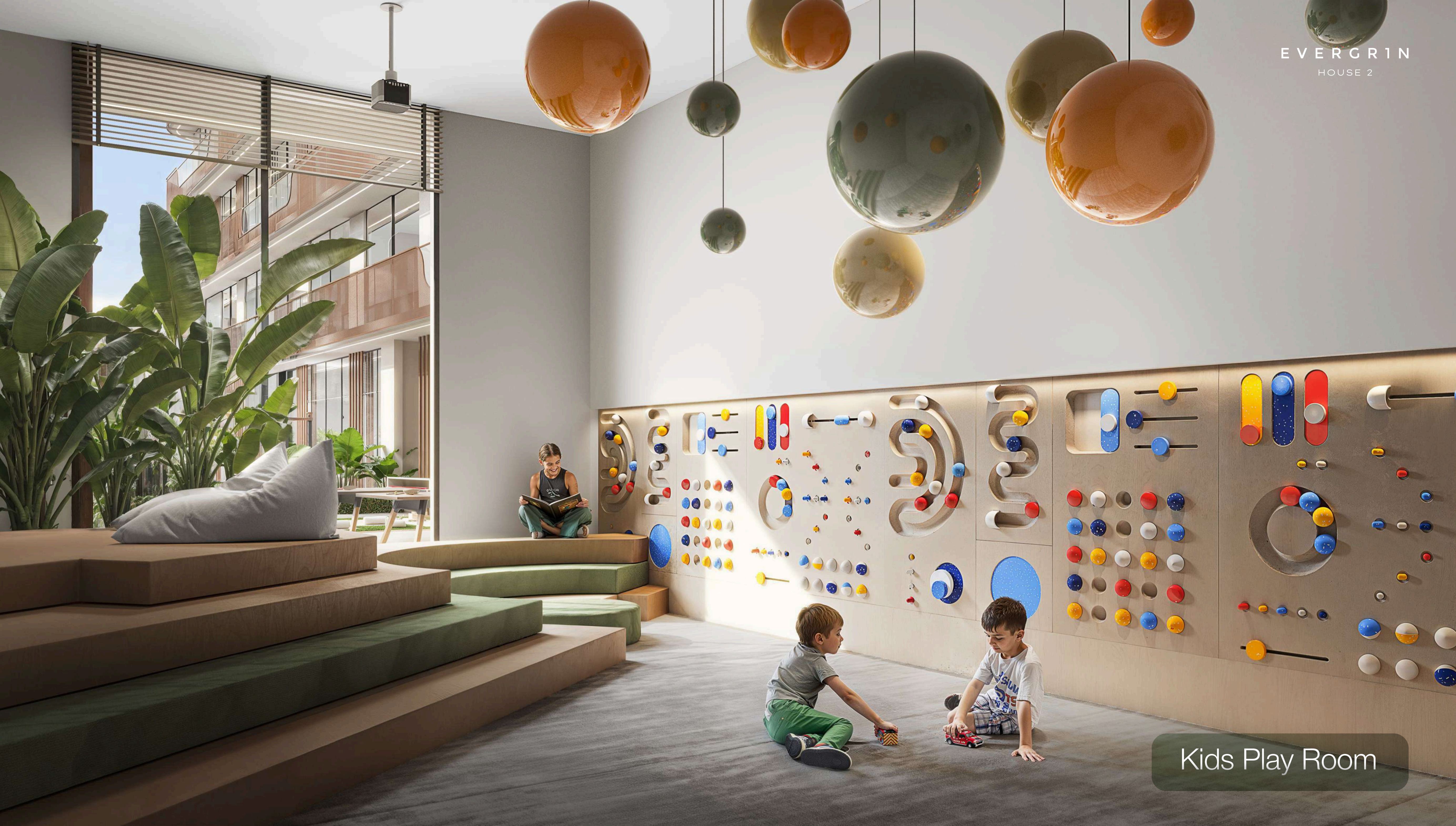
Kids Play Room