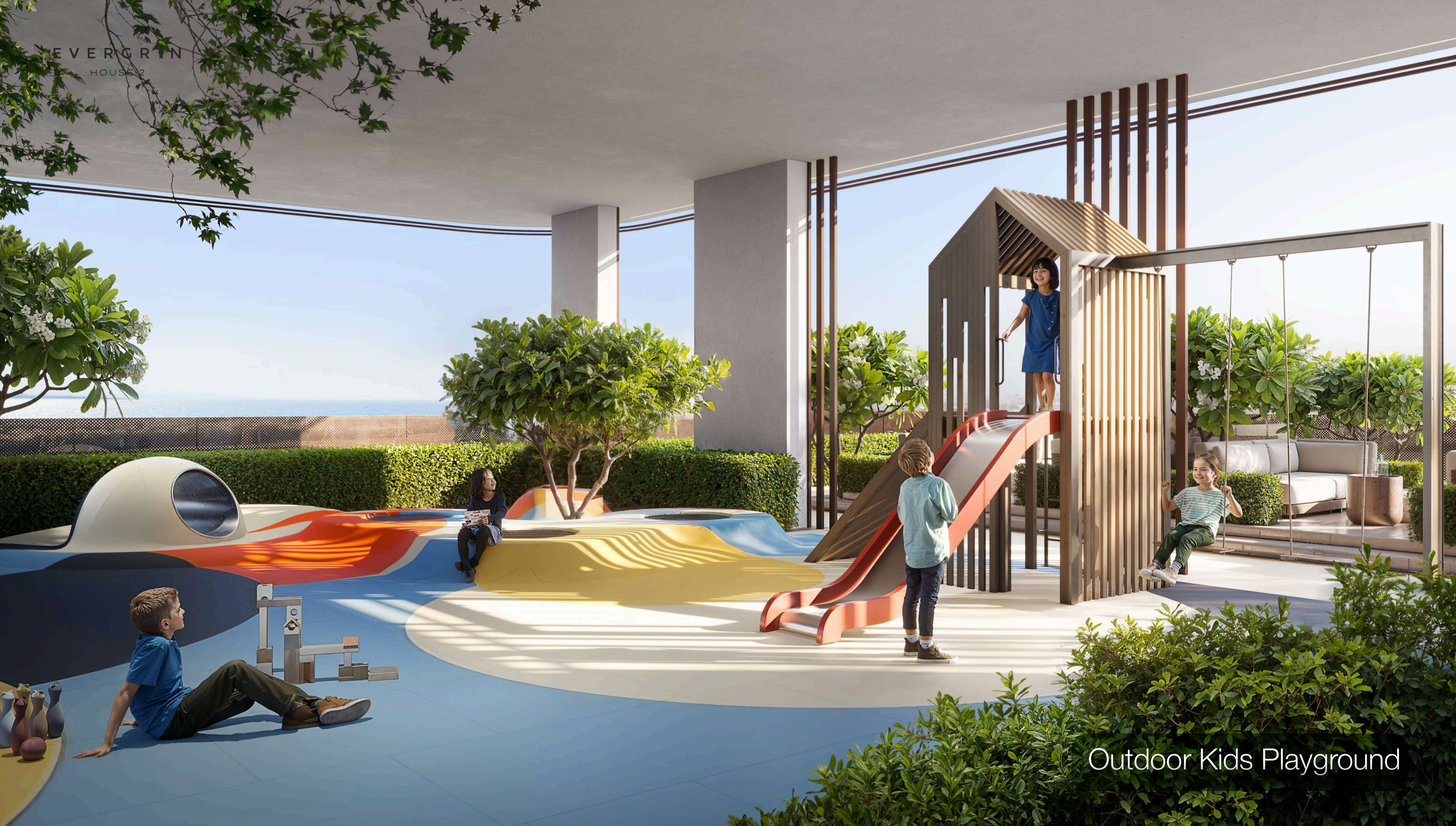
Outdoor Kids Playground