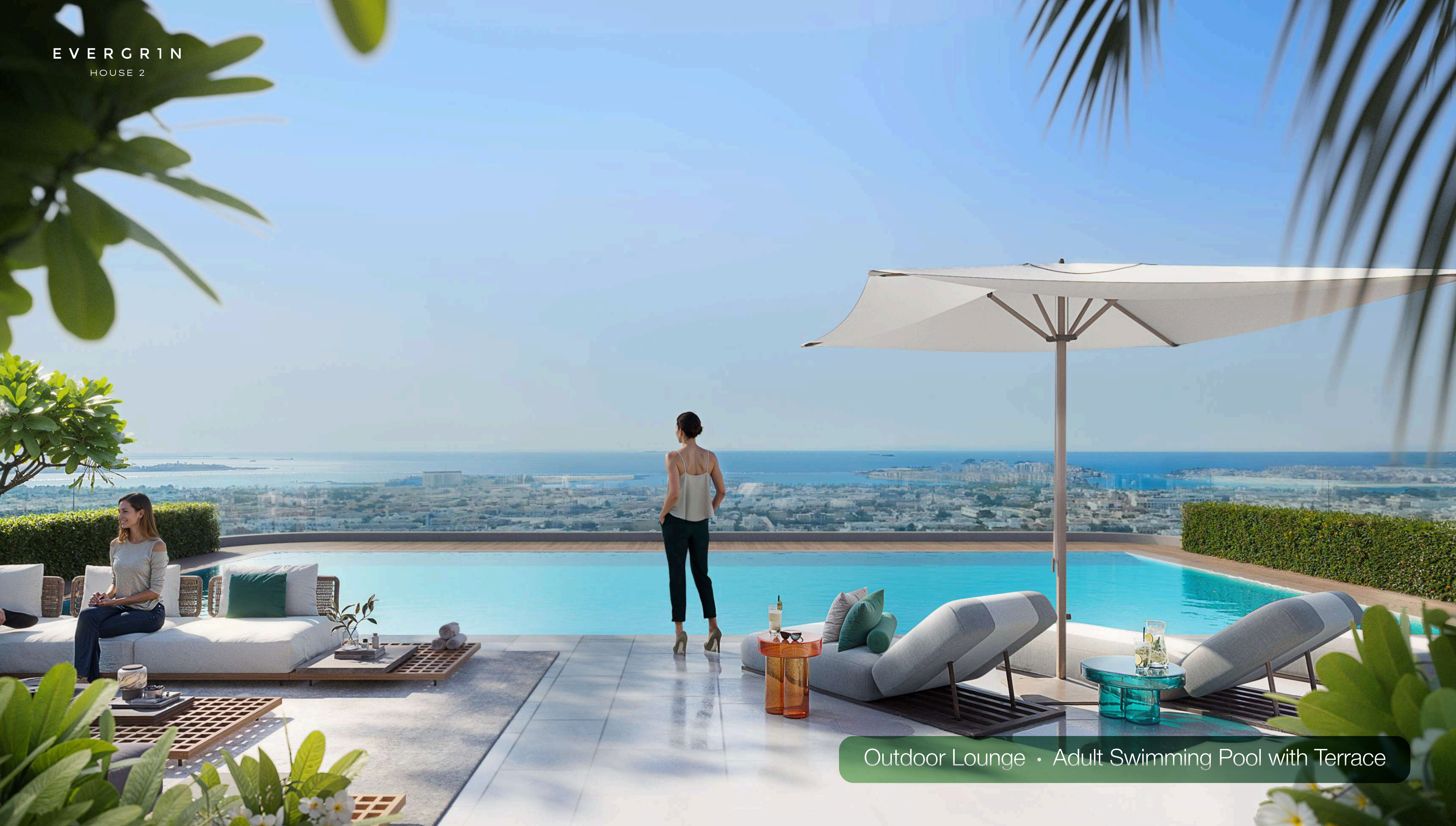
Outdoor Lounge • Adult Swimming Pool with Terrace