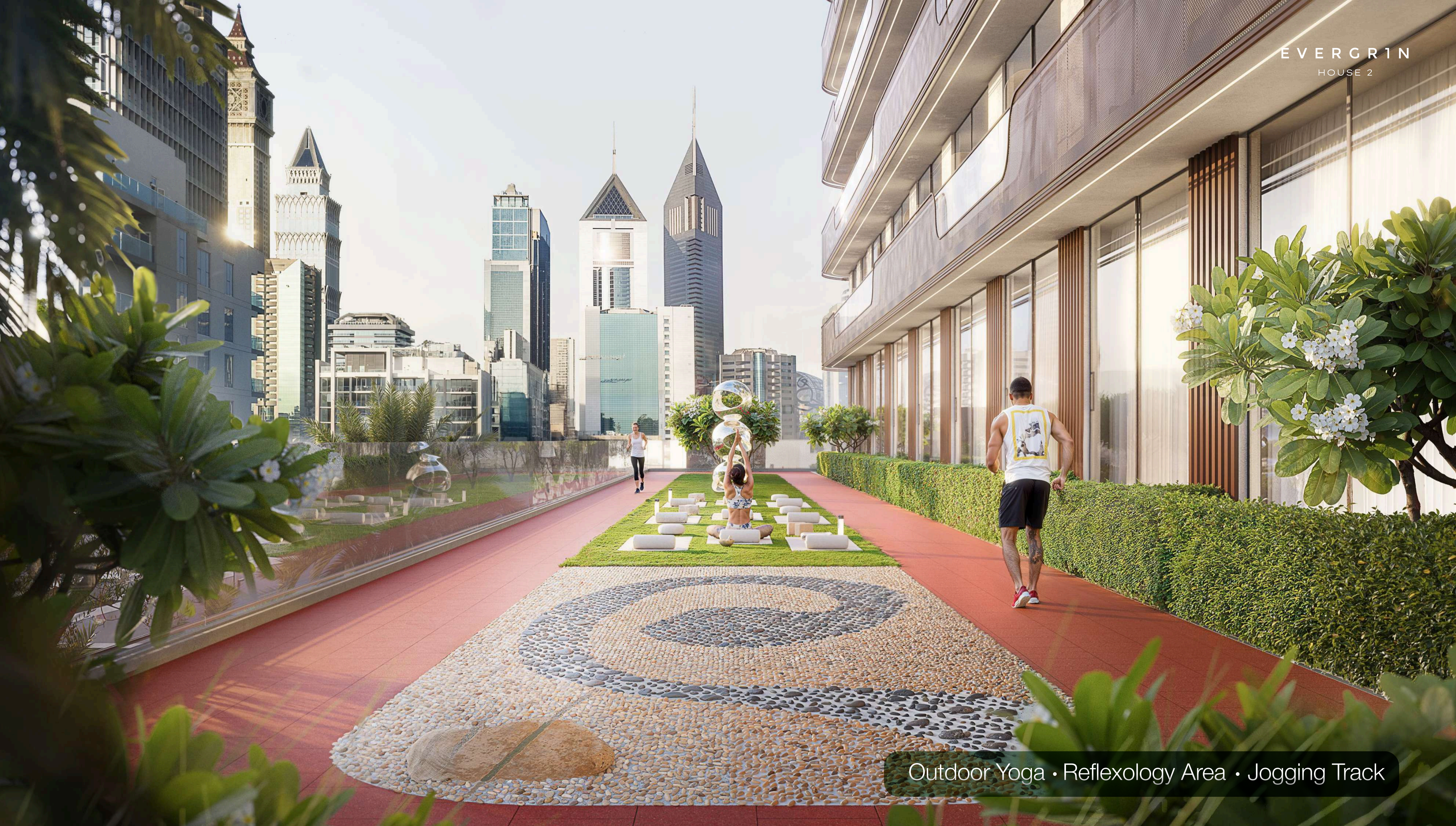
Outdoor Yoga • Reflexology Area • Jogging Track