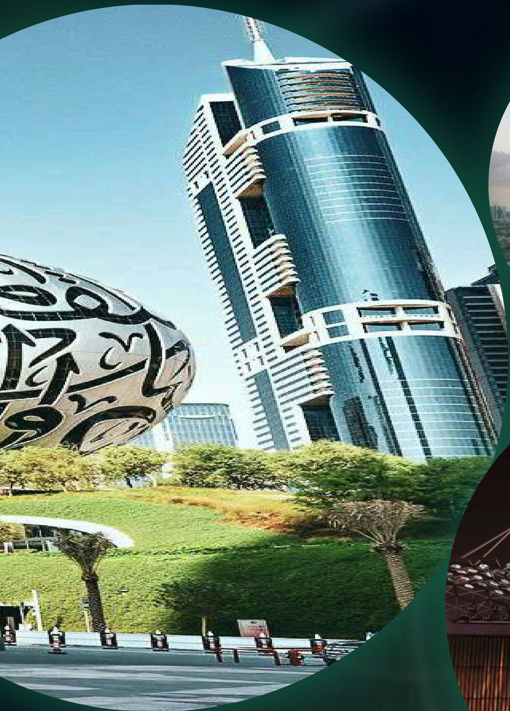
MUSEUM OF THE FUTURE