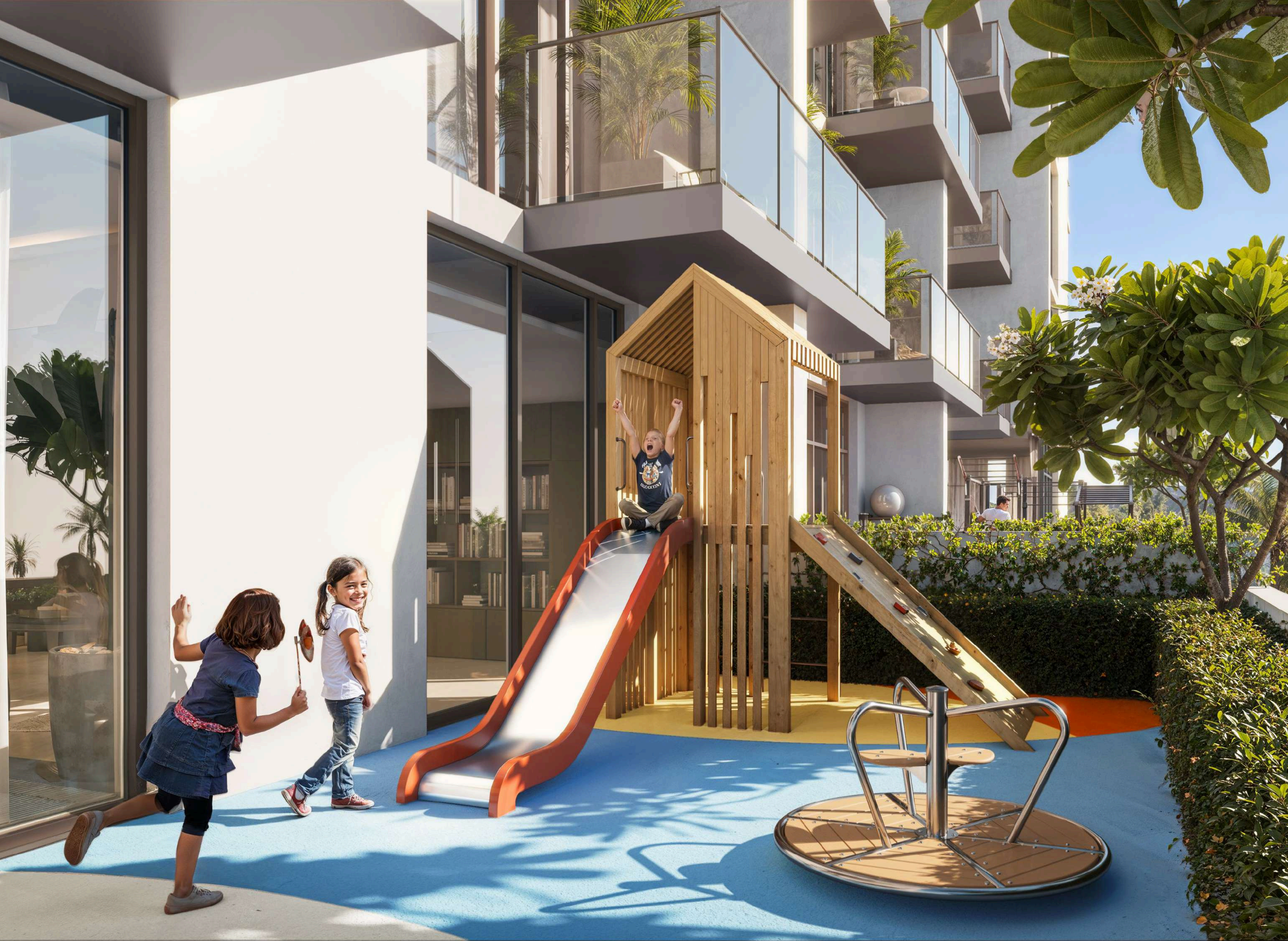
Outdoor Kids Play Area