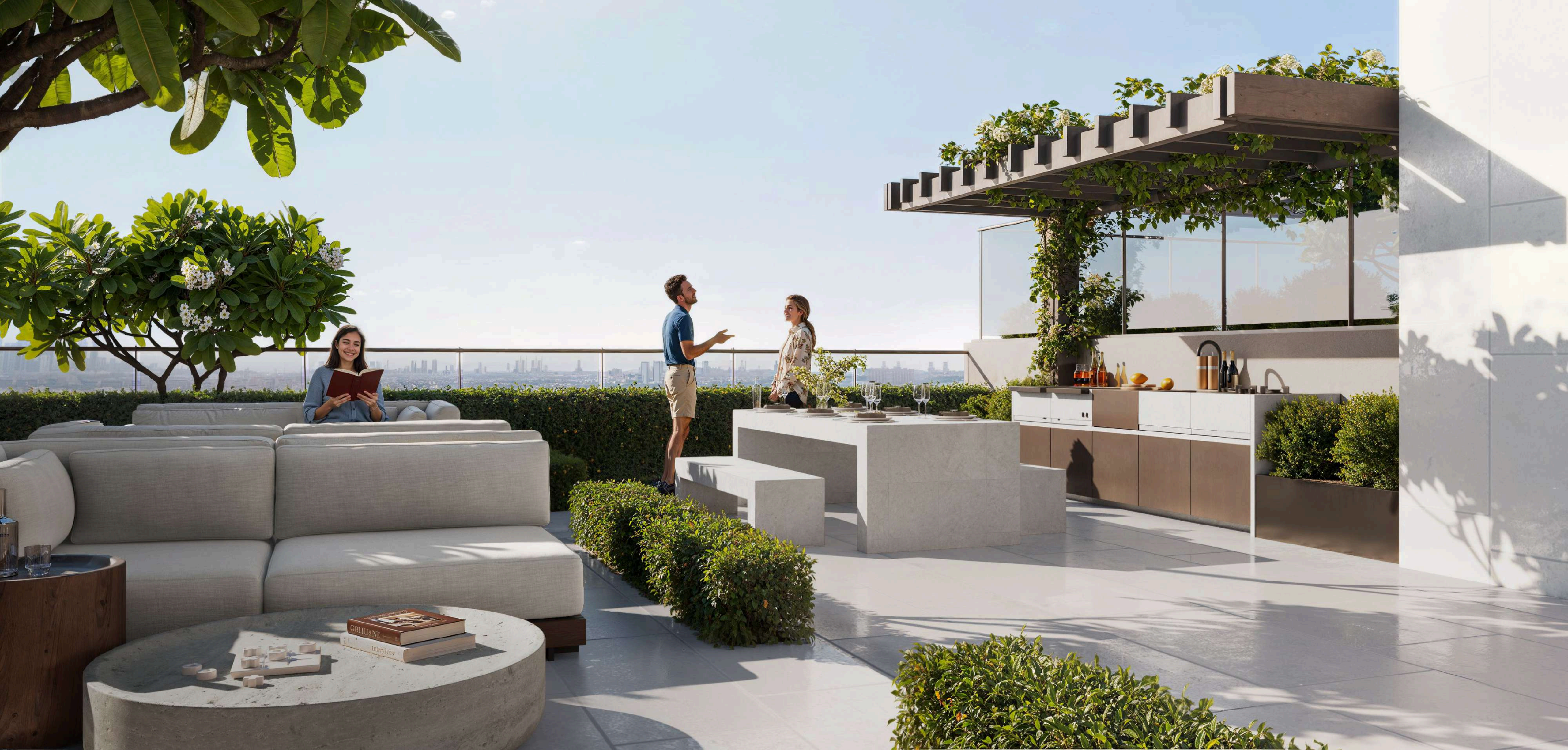
BBQ Area & Lounge