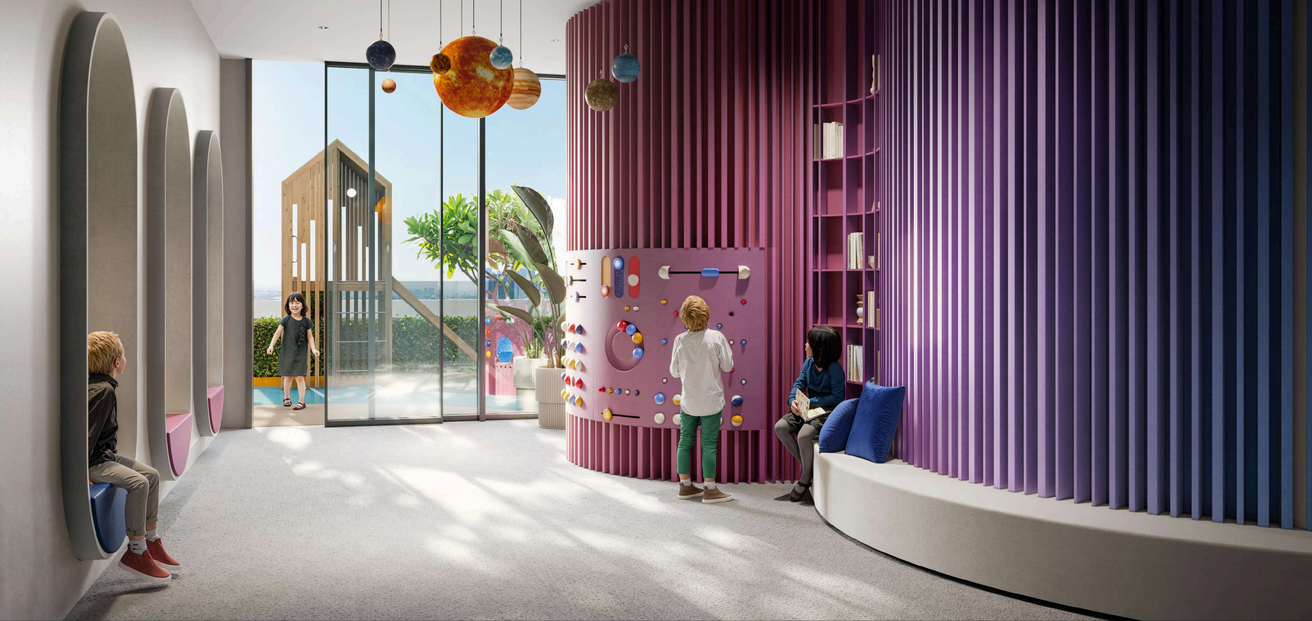
Kids Play Room