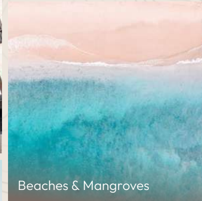
Beaches & Mangroves