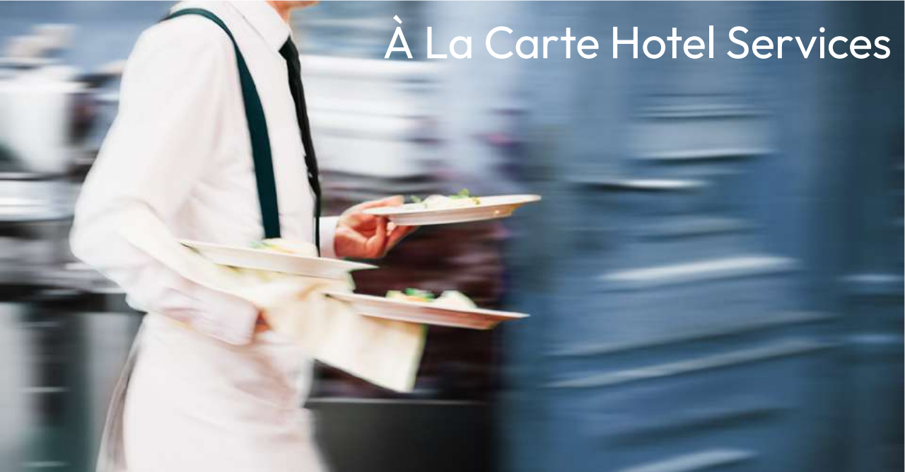
À La Carte Hotel Services