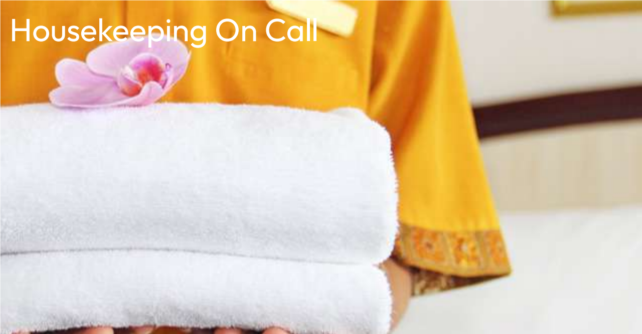
Housekeeping On Call