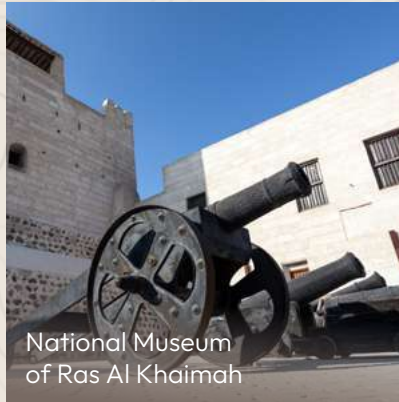
National Museum of Ras Al Khaimah