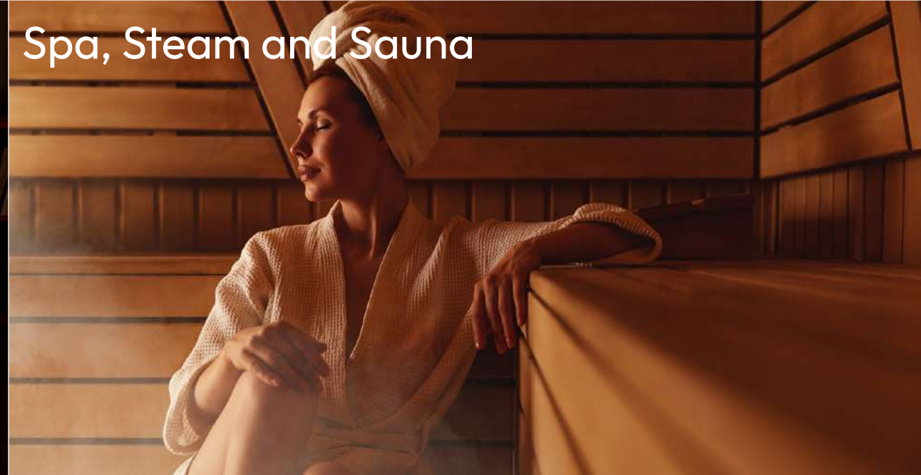
Spa, Steam and Sauna