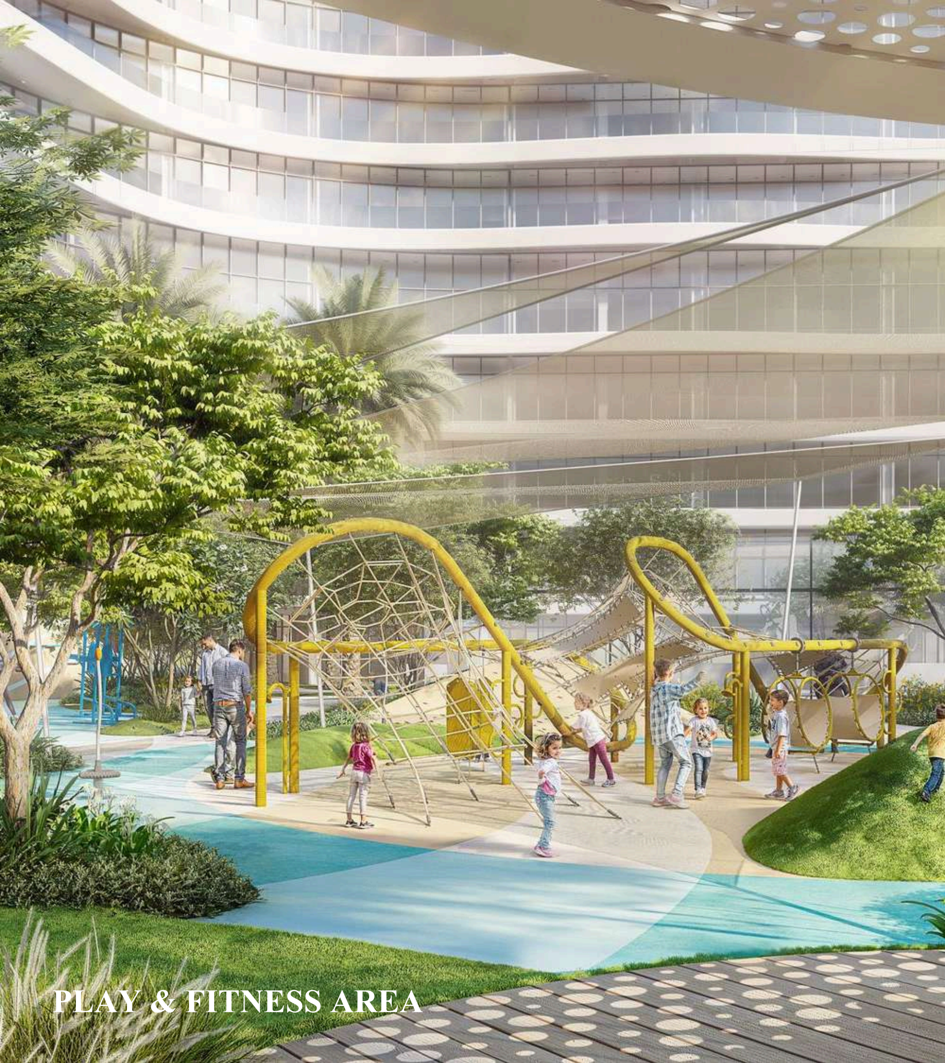
PLAY & FITNESS AREA