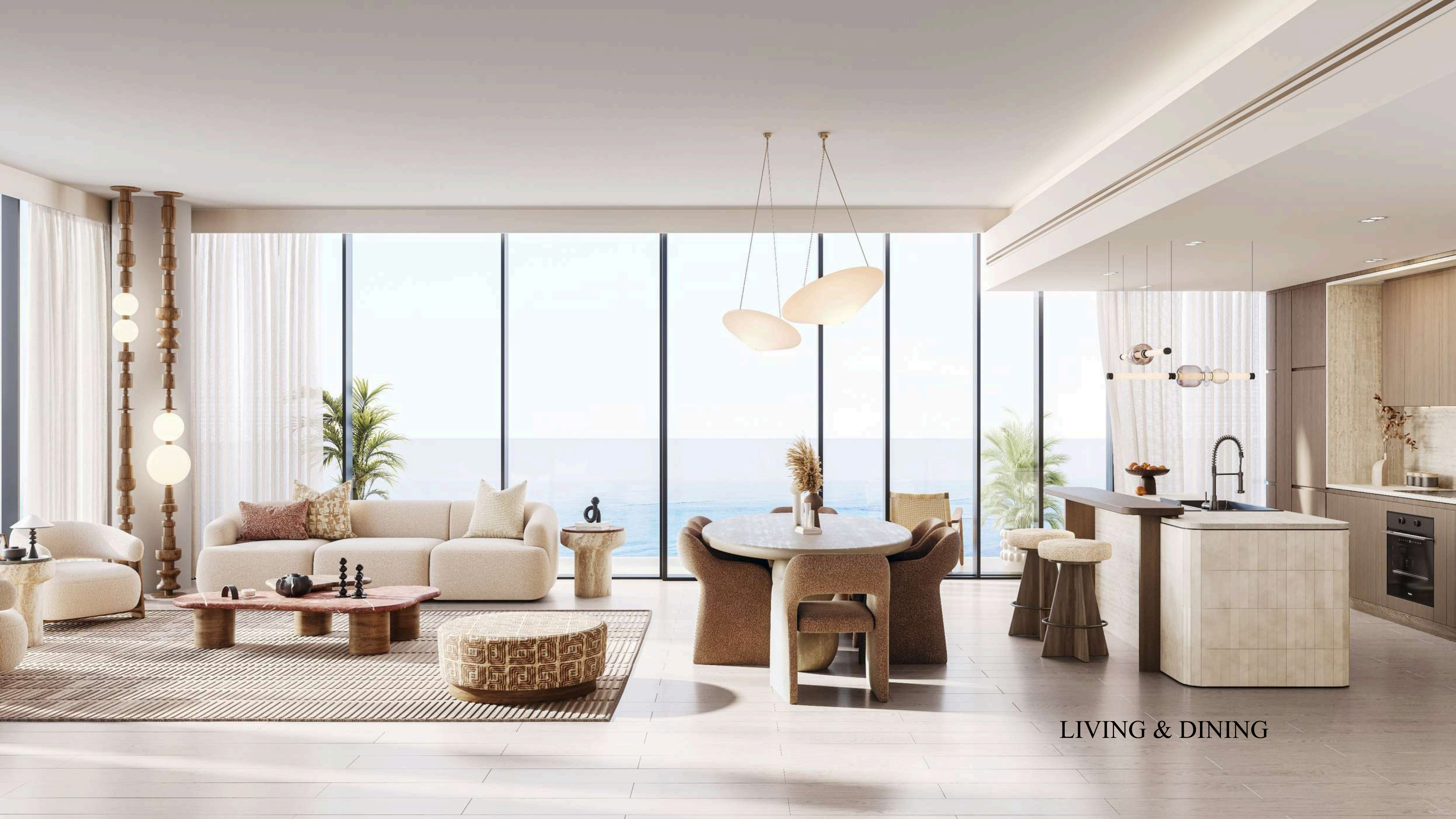
LIVING & DINING